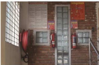
Fire Fighting Equipment