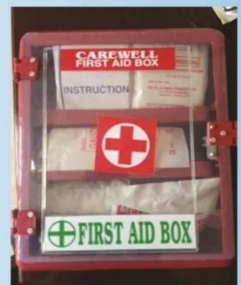
First Aid Box